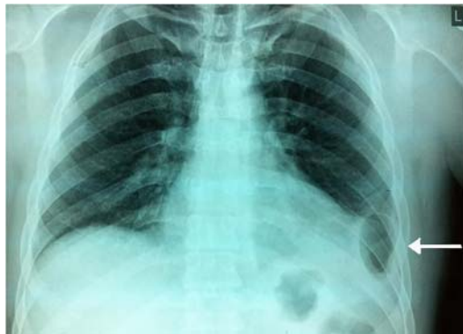
Figure 1 Plain chest film (white arrow) showing a colonic loop abnormally positioned into the left hemithorax.

A 32-year-old man with unremarkable medical history was urgently admitted with acute hypogastric pain of 24 h onset. On presentation he was apyrexial. Clinical examination revealed low abdominal tenderness with moderate rebound; bowel sounds were normal. The patient reported undisturbed stool and flatus passage; digital rectal examination revealed the presence of stool in the rectum without any tenderness or blood. Complete blood count showed a marked leukocytosis of 18\,610/\mu\text{L} with an elevated neutrophilic differential (92.4%). Plain chest (figure 1, white arrow) and