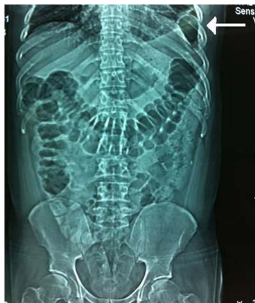
Figure 2 Plain abdominal film (white arrow) depicting the intrathoracic colonic loop.