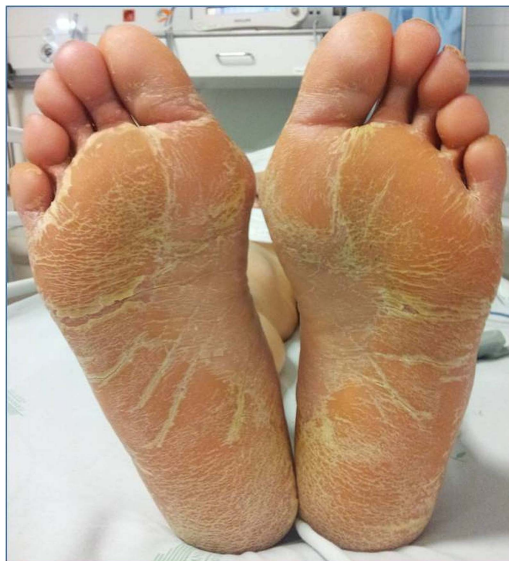
Figure 1 Symmetric, diffuse and yellowish hyperkeratosis of the plantar surfaces, compatible with diffuse plantar keratoderma.

To the best of our knowledge, this is the first case reported of acquired palmoplantar keratoderma associated with xanthogranulomatous pyelonephritis.