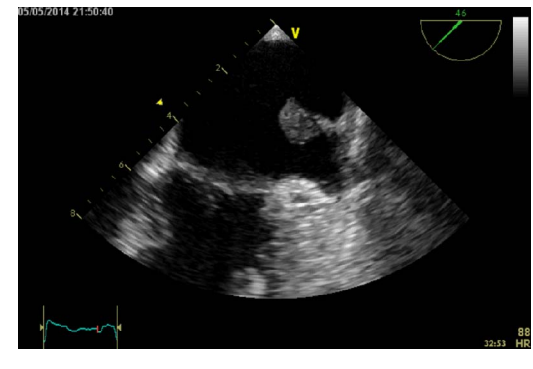
Video 2 Magnetic resonance imaging of pedunculated structure between the left atrial appendage and the left upper pulmonary vein.

Primary cardiac tumours are extremely rare (0.02% of autopsies), whereas metastasic involvement of the heart is 20 times more common. Papillary fibroelastoma is the second most common primary cardiac tumour found in adults. Cardiac tumours may be symptomatic or found incidentally. Signs and symptoms of cardiac tumours are generally determined by their location and not by the histopathology. More than 80% of fibroelastomas are located on the heart valves, few in the ventricles and even less in the left atrium (1.6%). Primary cardiac tumours are extremely rare causes of ischaemic cardiovascular events.