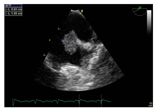
Figure 1 Transoesophageal echocardiography showing the size of the structure in the left atrium.