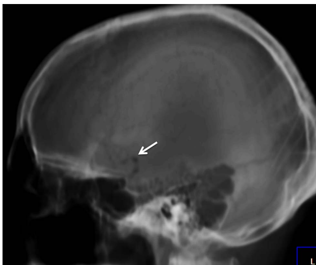
Figure 3 Air lucencies are also visible in the scanogram along the sites of cerebral vessels (white arrow).