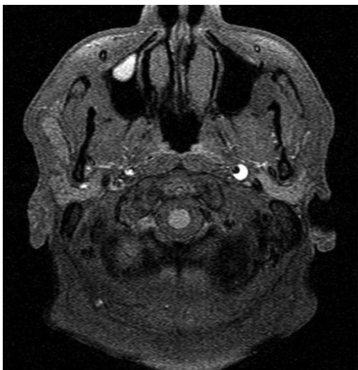
Figure 2 Fat-suppressed T1-weighted MRI showing a crescent-shaped haematoma within the wall of the left internal carotid artery, adjacent to the eccentric lumen.

The sudden onset and presence of vascular risk factors (arterial hypertension, diabetes and dyslipidaemia) favours an ischaemic aetiology. An infarct involving oculomotor nucleus is rare and clinically different from III cranial nerve palsy. Paired oculomotor nuclear complexes are located in dorsal midbrain at superior colliculus level. An infarct involving the caudal subnucleus located in midline may result in bilateral ptosis as this nucleus provides innervation for bilateral levator palpebrae superioris . As already described, our patient had a unilateral ptosis that did not support this hypothesis.