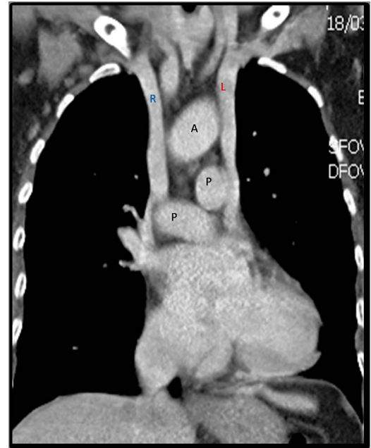
Figure 2 The coronal reformats of the contrast-enhanced CT scan of the thorax that demonstrates the persistent left-sided superior vena cava (L) (A, aorta; P, pulmonary artery; R, right-sided superior vena cava).

through the coronary sinus; the remaining 10% (as in the index case) open into the left atrium. 1 The latter group is predisposed to paradoxical embolism because the pulmonary circulation which acts as a natural filter to all emboli is bypassed. Approximately 50 mL air can be tolerated in the right side of the heart, whereas 0.5 mL of air on the left can pass directly into the systemic circulation and cause potentially fatal embolism. 2 3