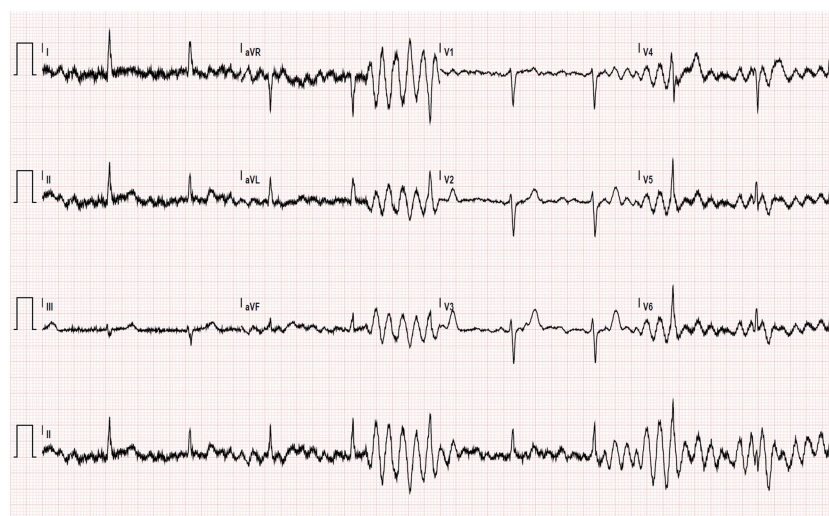
Figure 1 Twelve-leads ECG with the electrodes placed on arms extremities of the patient showing sinus rhythm with artefacts mimicking wide-QRS complex (torsades de pointes).

Ventricular arrhythmias are usually associated with haemodynamic instability (hypotension, chest pain, dyspnoea, syncope), while our patient did not show any of these signs.