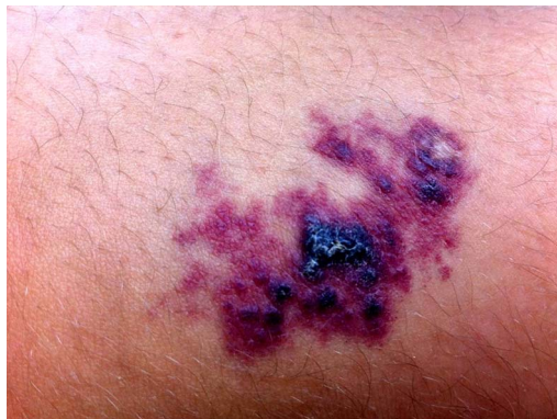
Figure 1 Located at the upper end of the anterior aspect of the left leg, we observed a 4.5×3.9 cm, irregular hyperkeratotic bluish plaque with elastic consistency, without murmur or increased temperature.

VH is a rare congenital vascular anomaly. The International Society for the study of vascular anomalies classifies vascular anomalies as vascular neoplasms or vascular malformations. In verrucous haemangiomas, categorisation as a neoplasm or malformation cannot be established definitely. Its classification is still unclear because it exhibits clinical features similar to those seen in vascular malformations, but expresses an immunoprofile similar to vascular neoplasms (WT1 and Glut-1 positivity). 1