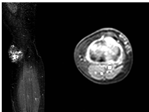
Figure 2 MRI showing serpiginous vascular structures, occupying almost the entire subcutaneous tissue.