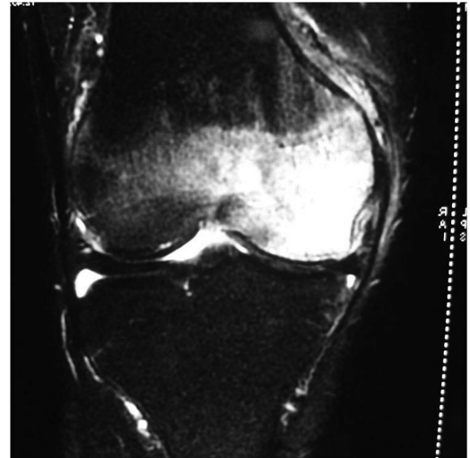
Figure 2 T2-weighted images of the MRI showing hyperintense area involving the medial femoral condyle of the knee and a visible fracture line in the subchondral bone.