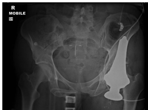
Figure 1 Anteroposterior pelvic X-ray showing metal spike in situ.

was undertaken 7 days later using a Smith and Nephew recon-plate (figure 3). The patient was rehabilitated by mobilising partial weight bearing on her left leg. Prior to discharge the patient had full sensory and motor function.