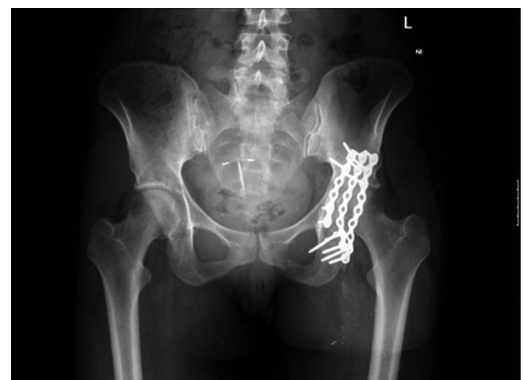
Figure 3 Post fixation anteroposterior pelvic X-ray showing recon plate in situ.