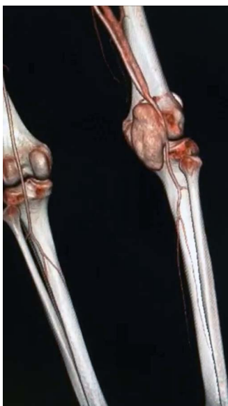
Video 1 A 360-degree view of the volume rendered three-dimensional reconstruction of lower limb CT arteriogram. A pseudoaneurysm of the left popliteal artery and an arteriovenous fistula with the common femoral vein is demonstrated.