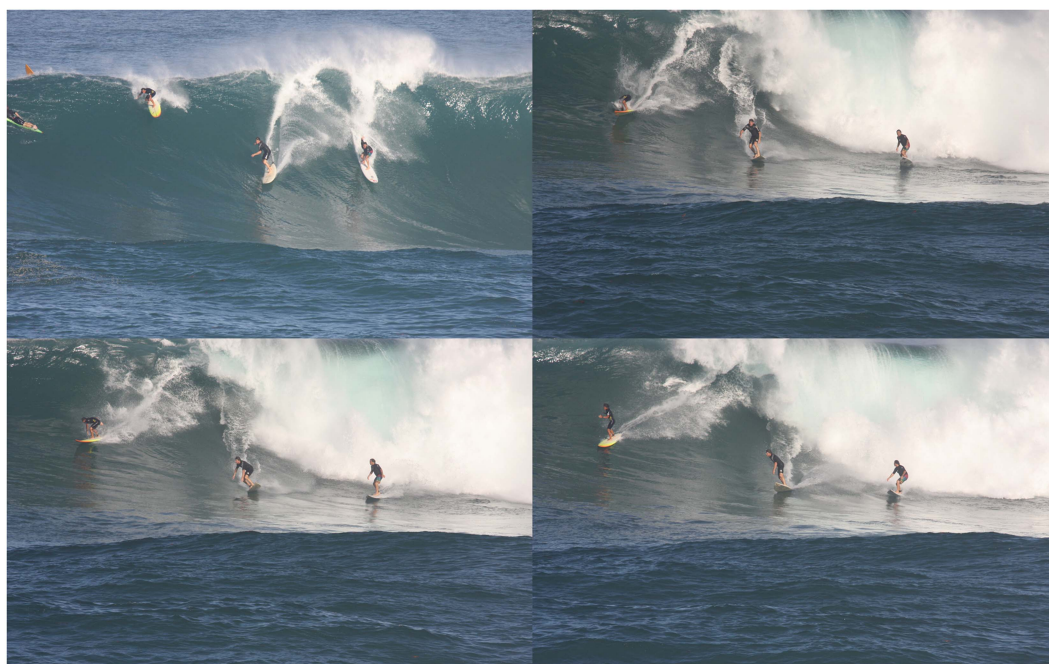
Figure 1 The surfer (top left on yellow and red board) overbalancing while surfing a ~10 m wave at Waimea Bay. He momentarily dipped his face into the water while travelling at top speed but was able to recover his balance and continue surfing the wave.

He momentarily dipped his face into the water while travelling at top speed (figure 1), but was able to recover his balance and continue surfing the wave. This impressive manoeuvre resulted in the pterygium being ripped off his eye surface (figure 2). The corneal component was cleared and his visual and foreign body sensation symptoms improved. Although the wound site was inflamed for several days, it ultimately recovered without medical intervention. To my knowledge, this is the first recorded instance of such an unconventional approach to dealing with ‘surfer’s eye’. As of June 2013, the pterygium had not returned. The author has recommended that if it does return, the surfer should seek a more traditional method of pterygium removal through his nearest ophthalmologist.