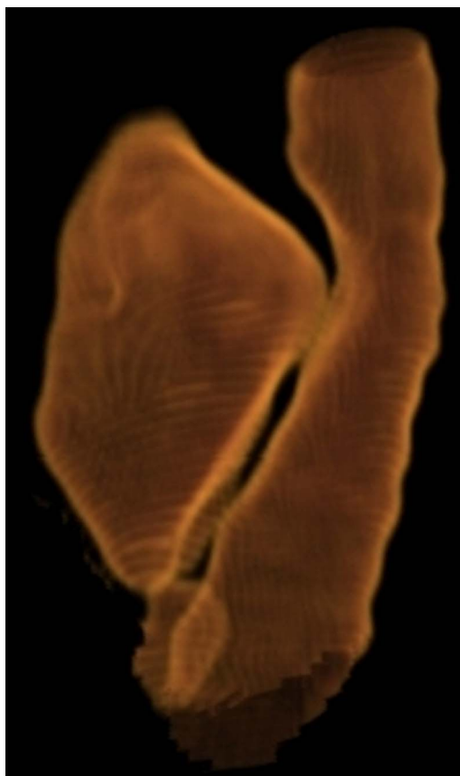
Figure 3 Three-dimensional reconstructed image showing the herniated right apical lung segment displacing the trachea to the left.