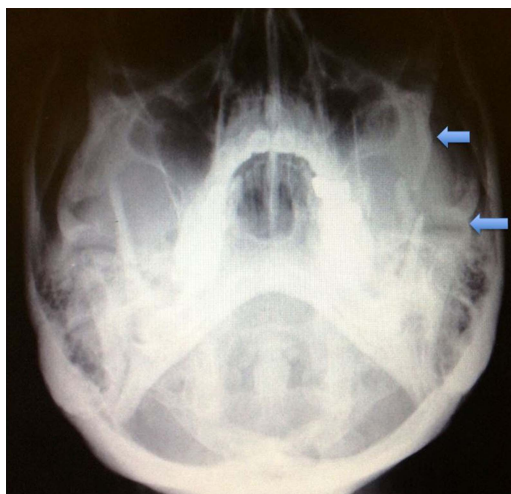
Figure 2 Occipitomental X-ray illustrating two fractures in the left zygomatic arch.