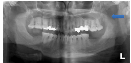
Figure 3 Orthopantomogram showing fracture of the coronoid process of the mandible.