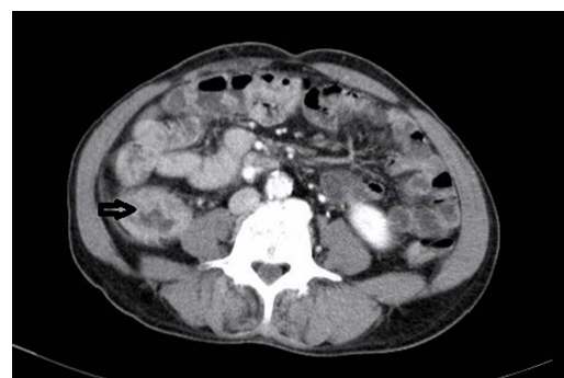
Figure 1 CT scan of the abdomen showing irregular wall thickening of the caecum.

A 60-year-old man attended our outpatient clinic with the chief complaints of right lower quadrant pain and fever of 4 days' duration. There was no history of diarrhoea or the passage of blood or mucus in the stools. General examination was unremarkable, but physical examination of the abdomen revealed a 4×3 cm firm, tender, mobile lump in the right lower quadrant. Blood investigations showed an elevated leucocyte count of 12 900. Ultrasonography (USG) of the abdomen, which had been performed elsewhere, showed thickening of the caecal and ascending colon wall. A contrast-enhanced CT of the abdomen at our institution confirmed the USG findings (figure 1). Colonoscopy showed ulcerations starting from the hepatic flexure and extending down to involve the ascending colon, caecum and the ileocaecal valve, with yellowish white exudates overlying the ulcers (figure 2). The rest of the colon including the rectum was normal. Biopsy of the involved areas of the colon revealed multiple trophozoites of Entamoeba histolytica (figure 3). The patient was started on treatment with parenteral metronidazole and within 48 h there was a dramatic response with resolution of symptoms and the beginning of a