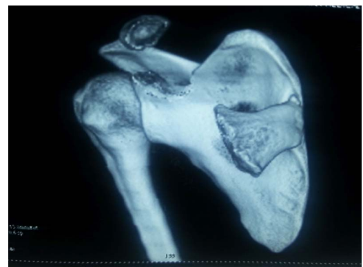
Figure 4 Three-dimensional CT scan images (reconstructed) showing a large bony tumour arising from the medial border of the body of the right scapula.