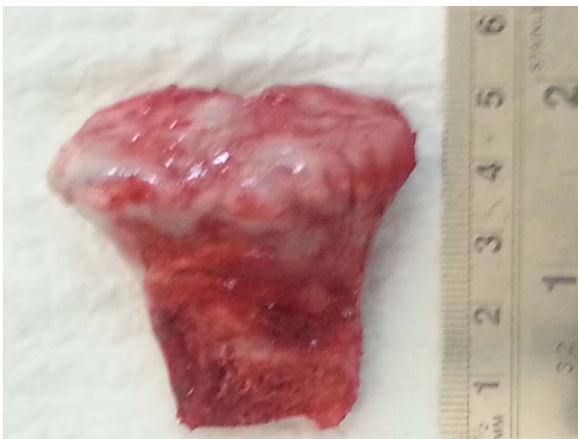
Figure 5 Excised specimen showing the bony tumour with cartilaginous cap.