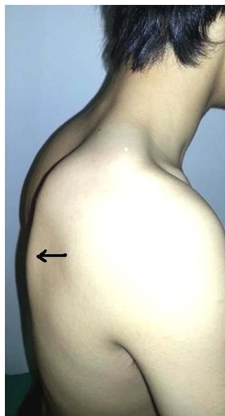
Figure 1 Clinical photograph showing pseudo-winging and deformity of the right scapula.

The growing potential of osteochondromas usually ends by the time of closure of growth plate (physis), and if the growth continues into adulthood, it should alarm the surgeon for possible malignancy.