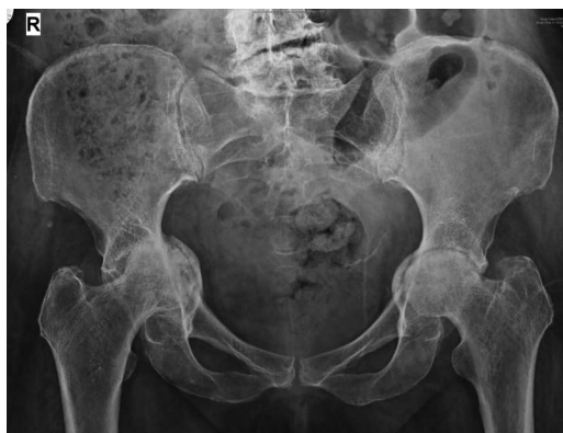
Figure 1 Preoperative X-ray of the pelvis showing bilateral hip arthritis and severe protrusio acetabuli.

Protrusio acetabuli is a condition of the hip where there is medial displacement of the femoral head into the pelvis and the medial aspect of the femoral head lies medial to the ilioischial line. 1 Protrusio acetabuli could be primary or secondary. Bilateral condition could be found in conditions such as rheumatoid arthritis, Paget's disease, ankylosing spondylitis, Marfan's syndrome and osteomalacia. The joint replacement surgery is usually necessary in cases of severe pain or substantial joint restriction owing to secondary hip arthritis. 2 3