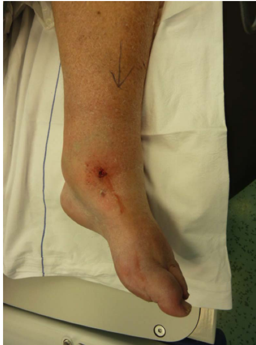
Figure 1 The forefoot is displaced lateral of the talus. Note the disruption of the skin where the talus head presses on the skin.

A 69-year-old woman presented to the emergency department with a painful left foot after a fall from