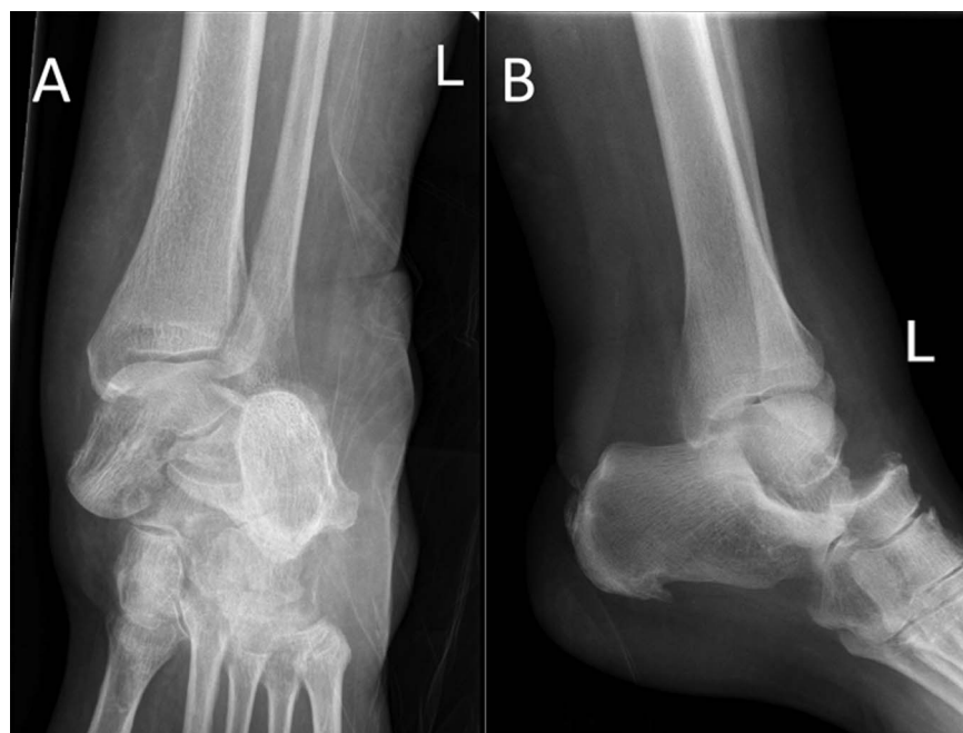
Figure 2 Anteroposterior view (A) and lateral view (B) on conventional X-ray showing clear dislocation of the forefoot compared to the head of the talus.

The postreduction CT scan showed a successful reduction of the talonavicular joint, some small