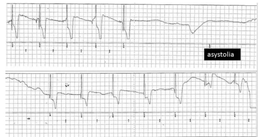
Figure 2 Episode of a 8.6 s sinoatrial node arrest, associated with an episodes of loss of consciousness and occurring in the elder sister, on a loop recording.