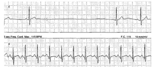
Figure 1 Episode of a 3.8 s sinoatrial node arrest, associated with an episodes of loss of consciousness and occurring in the younger sister, on a Holter monitoring recording.

In February 2013, two sisters, aged 18 and 24, presented with a history of episodes of loss of consciousness (ELCOs) occurring since childhood. In the past 2 years, the ELCOs increased to an average of 10/year, preceded by migraines and lasting at least 10 min, with loss of postural control and slow recovery. The sisters also reported, brief lapses of consciousness. In 2010 and 2012, sleep-deprived EEG, during-sleep EEG, ambulatory EEG and a brain MRI, were all inconclusive for epilepsy. A nitrate-stimulated tilt test was followed by a brief ELCO in both girls, reflecting an uncertain diagnosis of vasovagal syncope, as the patients presented with pretest orthostatic hypotension. 1 The finding of sinoatrial node arrest with ELCOs on Holter monitoring in the younger sister (figure 1) and on loop recording in the elder sister (figure 2) supported dual-chamber pacemaker implantation, in July 2012 and January 2013, respectively. Nevertheless, the ELCOs did not cease, and a neurological workup was again inconclusive. In May 2013, a patients' relative documented a seizure episode in the elder sister through a series of photographs and a video (figure 3 and video 1). These pictures might suggest a familial hemiplegic