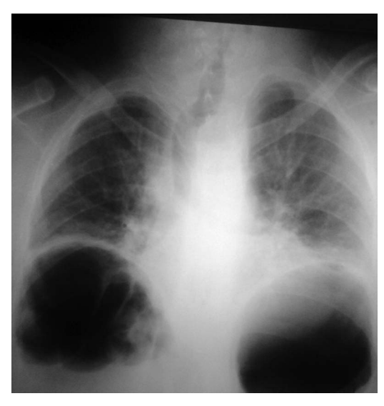
Figure 1 Chest radiograph showing the Chilaiditi sign.

A 49-year-old man presented to the emergency department with respiratory distress and extreme abdominal distension, with a history of chronic