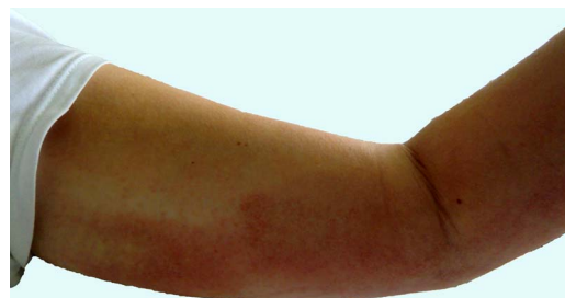
Figure 2 Lymphadenitis.

Cowpox virus infection in humans is uncommon and mainly seen in Europe. Humans in contact with infected cats, cows or small rodents can