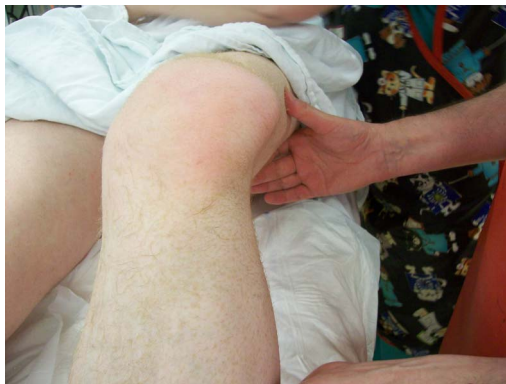
Figure 1 Photograph demonstrating irreducible lateral mass in the left knee.

A fit and well 21-year-old man received a blow to the medial side of his knee while dancing in a pub. He became immediately non-weight-bearing and attended the emergency department. On examination, his knee was held in partial flexion and there was a palpable hard mass lateral to the lateral femoral condyle (figure 1). Radiographs demonstrated a lateral patella dislocation (figure 2). Despite giving the patient 20 mg of intravenous morphine, several litres of entonox and 20 mg of midazolam, the emergency department and orthopaedic on-call teams could not reduce the patella. The patient was taken to theatre the next day