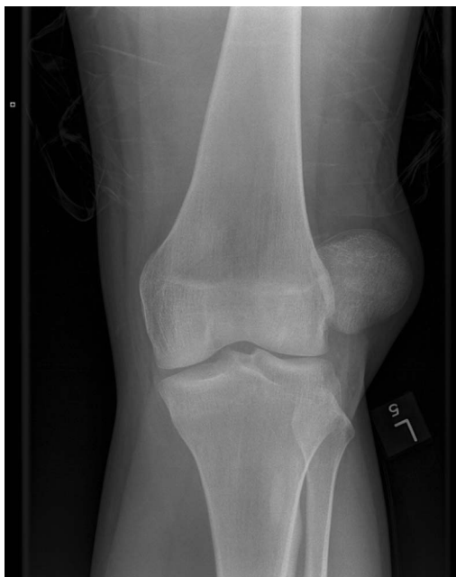
Figure 2 Left knee radiograph demonstrating lateral patella dislocation.