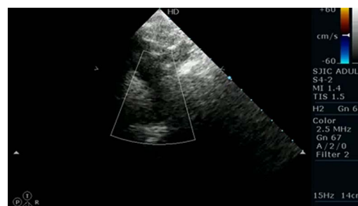
Video 3 Suprasternal long-axis view showing absence of coarctation.

muscles at times creating an appearance of double parachute mitral valve. It is an extremely rare congenital anomaly which is usually found in association with other congenital heart diseases especially atrioventricular septal defect (most common), coarctation of aorta, interrupted aortic arch, patent ductus arteriosus and ventricular septal defect. Isolated DOMV, without other associated defects, is an extremely rare anomaly and the exact incidence is not known. It can present as mitral regurgitation (most common), incidental finding or uncommonly mitral stenosis. 2 Abnormalities of the subvalvular apparatus are almost always present. It has been classified by Trowitzsch et al 3 in 1985 into three types: complete bridge, incomplete bridge and hole type. DOMV usually comes to attention as an incidental finding with other congenital defects. However, isolated DOMV can be easily missed in apical four-chamber and parasternal long-axis views. Parasternal short-axis view is the best to diagnose this entity and should be carefully interrogated even in the absence of other defects.