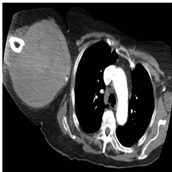
Figure 3 CT angiography (axial view), which shows large pseudoaneurysm.

including Doppler ultrasound, digital subtraction angiography and CTA like in the presented case. The goal of the treatment is to preserve the limb, which is achieved by exclusion of the pseudoaneurysm from the circulation, with or without the arterial reconstruction. 6–8