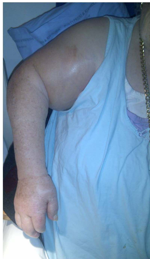
Figure 2 The patient with severe arm swelling and wrist drop.

To cite: Kaczynski J, Wilczynska M, Fligelstone L. BMJ Case Reports Published online: [please include Day Month Year] doi:10.1136/bcr-2012-007706