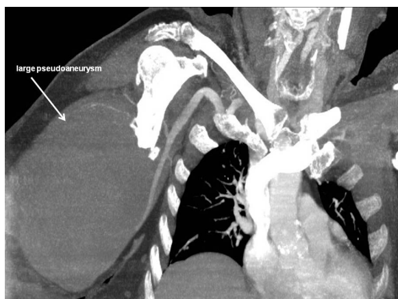
Figure 4 CT angiography (coronal view) presenting a large pseudoaneurysm in the arm.

Larger pseudoaneurysms require an invasive treatment by an open surgery. If the arterial defect is small it can be primarily