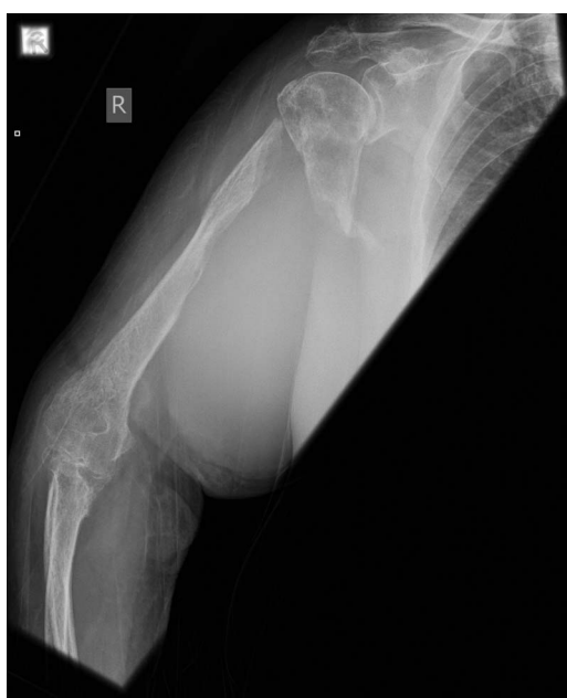
Figure 1 Anteroposterior x-ray of the right shoulder demonstrating chronic non-union of the proximal humerus.

Imaging has an important role in the assessing of size and anatomical topography of the pseudoaneurysm. Different imaging modalities can be used