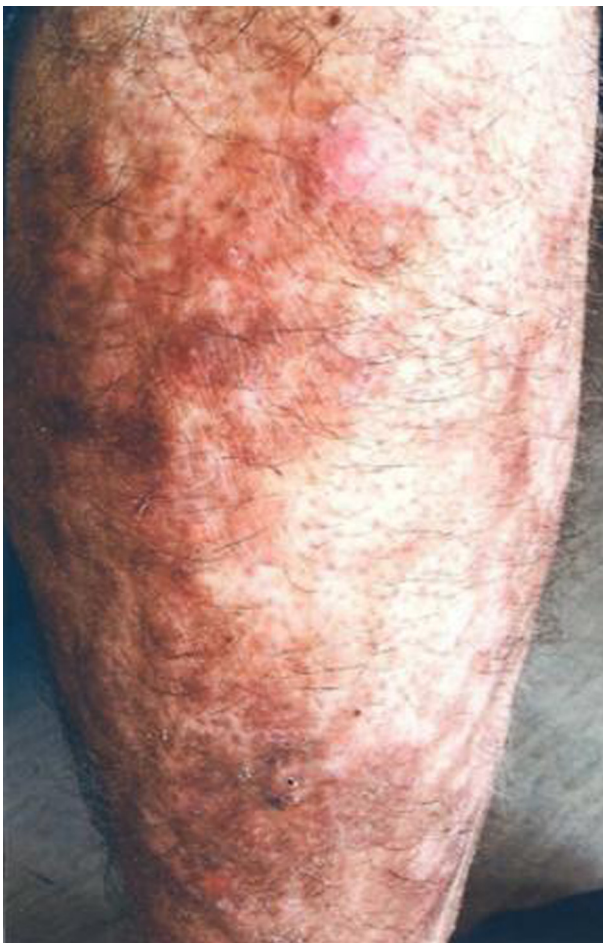
Figure 1 Rheumatoid nodules; thickening of both legs skin with multiple nodules of hard consistency.

that included inflammatory, bilateral and asymmetric polyarthritis of the wrists, metacarpal-phalangeal joints and conditioning articular deformity (figure 2). He also had tophi in forearms, hands, feet and ears (figure 3). Blood tests performed showed a serum uric acid level of 4.5 mg/dl, elevated inflammatory markers (erythrocyte sedimentation rate 56 mm/h and C reactive protein 2.8 mg/dl), positive antinuclear antibody titres of 1/320, positive rheumatoid factor of 53 and anticitrullinated protein antibody weakly positive – 25 U/ml. Hands radiography revealed exuberant joint destruction predominantly in carpal and proximal interphalangeal joints, juxta-articular new bone formation and enthesitis (figure 4). A biopsy of a cutaneous nodule was compatible with a rheumatoid nodule.