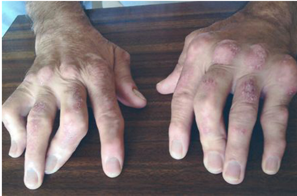
Figure 2 Exuberant articular deformity of both hands; multiple juxta-articular nodules in metacarpophalangeal joints.