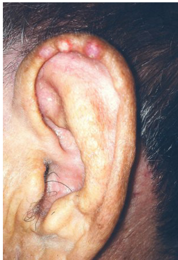
Figure 3 Multiple tophi in the curved ridge along the edge of the outer ear.