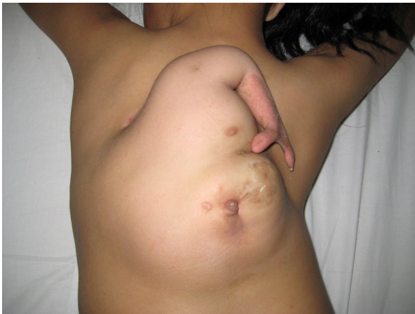
Figure 1 An 11-year-old girl had a large fetus in fetu in her back