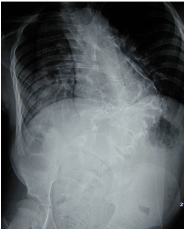
Figure 2 Anteroposterior spine radiograph showed congenital scoliosis anomalies