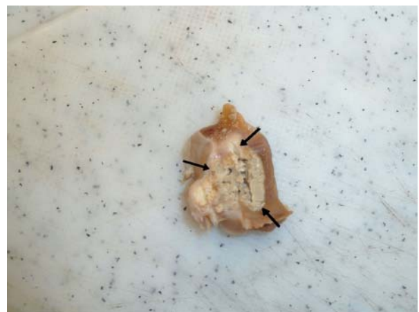
Figure 2 The pus-filled abscess (marked by black arrows) behind the mitral valve with yellowish calcification in the border zone.

infusion three times per day for 3 days, but on the fourth day after admission to hospital the patient collapsed in the bathroom, suffered sudden cardiac arrest as a result of ventricular tachycardia, and died.