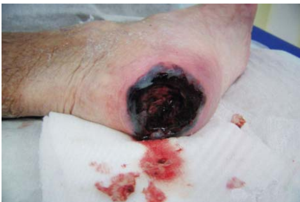
Figure 1 The necrotic heel decubitus ulcer extending to the muscle and the bone.