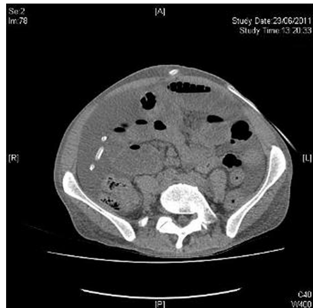
Figure 3 Non-contrast CT image showing multiple bowel loops with thickened peritoneum.