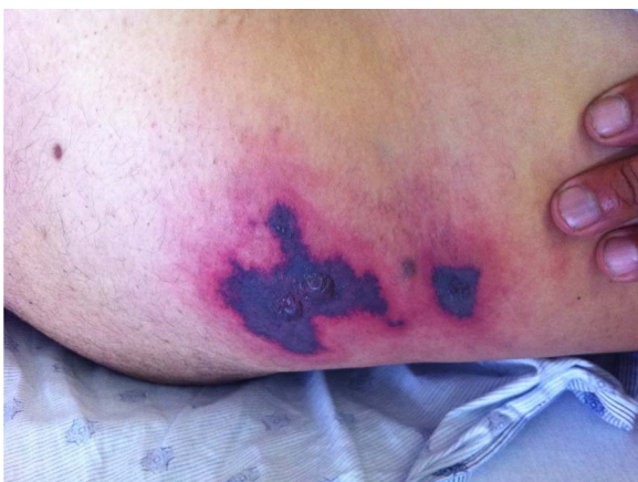
Figure 1 Skin ecchymosis and retiform purpurae.

A 43-year-old-man presented with 1-month history of progressive erythematous painful lesions over multiple sites involving bilateral lower extremities, trunk and pinnae. He was a chronic cocaine user; last use was 3 days prior to presentation. On examination he had bilateral large retiform, geometric, dusky, erythematous, tender plaques with central necrosis and ecchymosis over aforementioned areas (figures 1 and 2). There was significant necrosis of helical rims of pinnae. (figure 3). He had leucopenia with neutropenia on complete blood count. Perinuclear-antineutrophil cytoplasmic antibody (p-ANCA) was positive. Urine drug screen was positive for cocaine and levamisole was detected by gas chromatography technique in the patient's urine. Biopsy of skin lesions showed acute necrotising neutrophilic vasculitis involving small and medium vessels in both dermis and subcutaneous tissue with fibrin thrombi and fibrinoid necrosis. A diagnosis of levamisole-induced vasculitis with ecchymosis and necrosis syndrome was made from contamination of cocaine with levamisole. Levamisole has been identified as a contaminant in 70% of cocaine seized in the USA. 1 The prevalence of levamisole as a contaminant of cocaine may be related to its similar appearance to cocaine and stimulant effects from dopamine release. It is detected by gas chromatography mass spectroscopy technique in urine specimens. 2 Toxicity causes cutaneous, haematological and neurological manifestations.