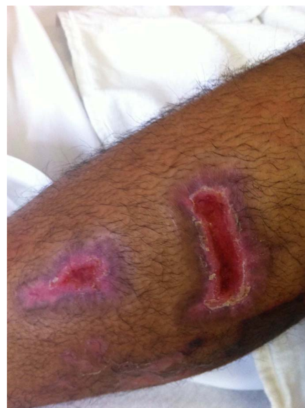
Figure 2 Skin necrosis.