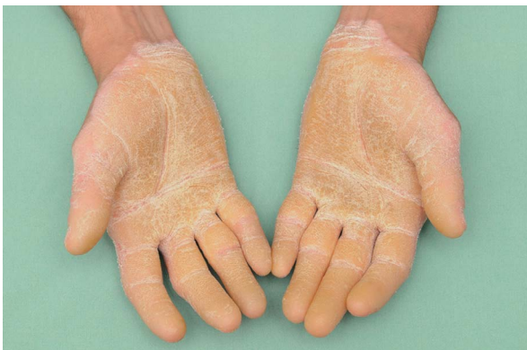
Figure 1 Clinical features with hyperkeratotic skin on both palms with red sharp margins.

As it is already known, the PPK follows autosomal-dominant inheritance with a mutation in the keratin 1 and 9 genes. 1 Recently, it has been shown that epidermolytic PPK due to keratin 9 mutation can lead to digital mutilation. 1 In a study from 1992, the family originally described by Thost showed typical histological features of epidermolytic hyperkeratosis very similar to Vörner's PPK. 2 In 2002, Küster et al 3 identified mutations in the same part of the keratin 9 gene. Hence, genetically PPK Unna-Thost and Vörner are the same entity.