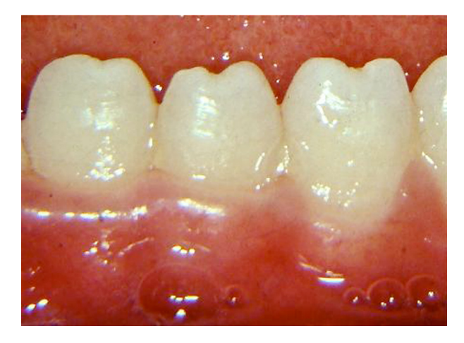
Figure 3 The semilunar notch on the incisal edge of mandibular incisors (Hutchinson's teeth).

birth). She was non-reactive for HIV. The patient was on regimen of penicillin treatment from late congenital syphilis and corticoid therapy. Hutchinson's triad was detected by the presence of interstitial keratitis (figure 1), with corneal scarring and initial presentation of bilateral blindness; deafness from auditory nerve disease and dental defects (figures 2 and 3).