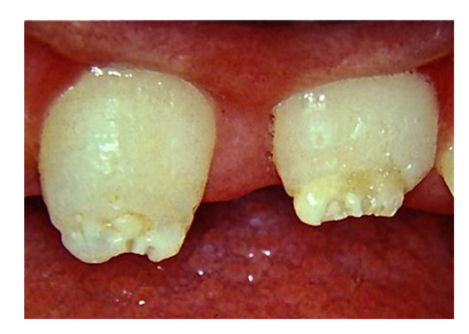
Figure 2 Enamel hypoplasia of maxillary central incisors (Hutchinson's teeth).

A 7-year-old female presented with her mother to the clinic with the complaints of poor dental esthetics. The patient was diagnosed with late congenital syphilis (2 years after