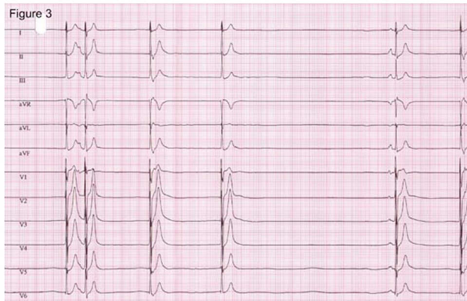
Figure 3 The subsequent ECG strip demonstrating junctional ectopy, with one beat conducted retrogradely to the atrium and another junctional ectopic which was not.

VT) and vasovagal syncope. Non-cardiac causes of syncope and psychogenic syncope have also been diagnosed, whereas 13–31% of patients presenting with syncope never reach a formal diagnosis. 1 A thorough history is indicated as certain features have been shown to be associated with potentially life-threatening diagnosis of long QT syndrome. Where these features are present (which include a family history of syncope or sudden cardiac death, palpitations, and syncope associated with exercise and emotional stress), particular attention should be paid to the QT interval, 2 which was of normal duration in our patient. In our patient, structural heart disease was excluded by transthoracic echocardiography. There were no features in the history to indicate coronary artery disease for which he had minimal risk factors. His exercise tolerance test demonstrated sinus arrest without any preceding arrhythmias consistent with a diagnosis of exercise-induced vasovagal syncope.