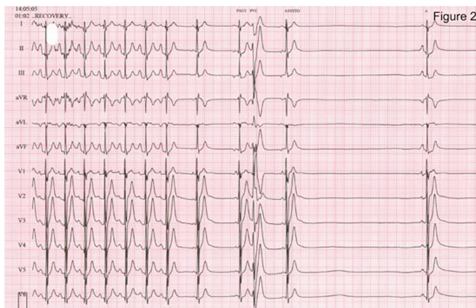
Figure 2 ECG taken 1 min and 10 s during recovery demonstrating sinus arrest with a pause of 5 s.

seconds into recovery, he described a feeling of dizziness and within 5 s had lost consciousness. His ECG demonstrated sinus arrest with a pause of 5 s (figure 2).