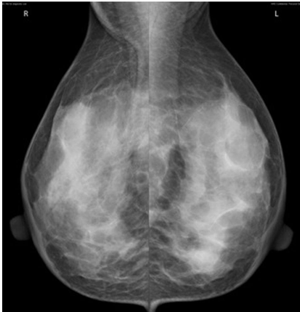
Figure 2 Moderately dense glandular breast tissue with no focal abnormality.

tissue disappears 6 months postinjection, 2 no literature evidence exists documenting long term effects of its use in the breast, especially in the case of injection in inexperienced hands. In light of this, we intend to follow-up and re-image the patient in 1 year. With awareness of this practice, it is important that we are able to recognise the appearance of collagen on mammography and be vigilant of how such appearances may obscure underlying abnormalities, possibly reducing the sensitivity and specificity of breast screening.