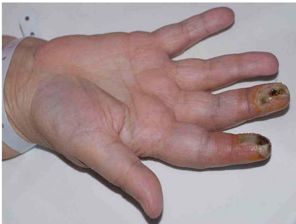
Figure 1 Digital ischaemia with secondary pulp space abscesses.

This highlights not only the need for a diagnosis in patients with acute ischaemia and no obvious source of