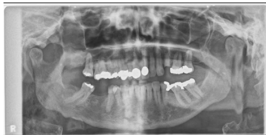
Figure 1 Panoramic radiograph showing carious lower right 5 and lower right 7, with periapical pathology associated with both teeth. The radiopacities in the right mandible reveal a chronic sclerosing osteitis, indicative of a long standing infection. Gas is also seen in the soft tissues around the right ramus.

Given the swelling extent, it was not surprising that frank pus was expressed through the extraction socket into the oral cavity following removal of LR7. What was surprising, however, was the presence of bubbles, representing escaped gas from the widespread subcutaneous emphysema passing through the pus (video 1).