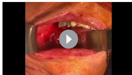
Video 1 Intraoperative video of gas escaping during drainage of abscess.

Following the initial drainage, there was continued pus production from all drain sites necessitating a further surgical intervention involving two general anaesthetics, two intravenous sedations and two local anaesthetic drainage procedures. She remained an inpatient for 25 days, with use of 5 antibiotics under advice of microbiology (clindamycin, metronidazole, vancomycin, doxycycline