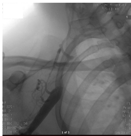
Figure 2 Venography of right upper extremity before procedure showing complete occlusion as the axillary vein entered the chest with scant collateral vessels.

intravenous infusion for 24 hours without any complications. An interval venography which was performed after a day of the procedure demonstrated a reduction in the size of the subclavian thrombus but persistent large obstructing thrombus at the first rib. There was a residual 80% obstruction that correlated with the triangle formed by the scalene anterior muscle posterior to the subclavian vein, the first rib beneath the vein and the clavicle above the vein (figure 3). The obstruction appeared to be complex indicative of possible residual fibrotic material or thrombus. An additional 2 mg alteplase intracatheter bolus was given and intravenous infusion of 1 mg/hour was restarted for another 24 hours. A 12 mm (length) × 40 mm (diameter) balloon angioplasty with pressure of 10 atm was later performed. Interval venography showed persistent 80% obstruction in the subclavian vein with good flow into a central venous system with no progression compared with the previous image findings (figure 4). No embolism following balloon angioplasty has been observed. The patient was discharged on rivaroxaban and was scheduled to undergo thoracic first rib resection in 3–4 weeks.