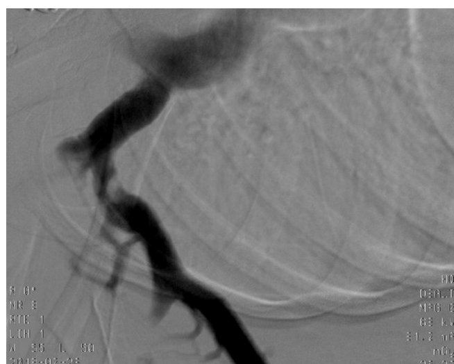
Figure 4 Venography of right upper extremity post second intracatheter thrombolysis and balloon angioplasty showing unchanged residual 80% obstruction with good flow into the central venous system.

thrombosis (DVT) usually due to anatomical abnormalities of the thoracic outlet with subsequent compression of the axillosubclavian vein. 1 Various structural anomalies known to cause thoracic outlet obstruction are hypertrophied muscles, cervical ribs, long transverse processes of the cervical spine, musculoskeletal bands and clavicular anomalies of the first rib. 2 The syndrome is predominantly witnessed among young healthy individuals and it usually manifests with sudden upper extremity pain and swelling following repetitive or strenuous exercise. 1 Repetitive movements of the upper extremity result in perivenous subclavian