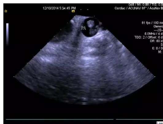
Video 1 Intracardiac echocardiogram revealing large thrombus involving the right atrium and left atrium as it straddles the PFO. PA, pulmonary artery.

Intracardiac surgery confirmed a biatrial thrombus straddling the PFO (TSPFO). An extensive main pulmonary artery clot was also discovered and removed. Pathology report revealed a 20.0×1.0cm intracardiac thromboembolic clot and a 2.5×8.0×1.0cm pulmonary artery thromboembolic clot. Following the procedure, the