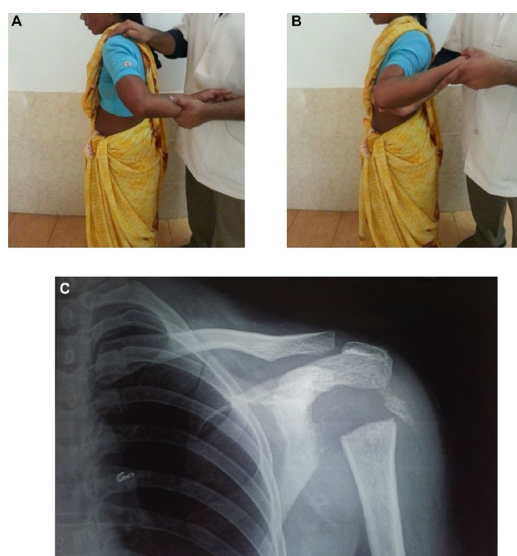
Figure 1 (A,B) Exaggerated external and internal rotation with the shoulder abducted to 90°. (C) A plain radiograph of the shoulder joint demonstrating resorption of the humeral head.

GSS is included in a heterogeneous group of disorders characterised by idiopathic osteolysis. 1 GSS affects both the axial and appendicular skeletons, but has a preponderance towards the maxillofacial bones, the shoulder and the pelvic girdles. The aetiology of GSS is not very clear. Dysregulation of osteoclast function and proliferation of lymphangiomatous tissues have been considered the widely accepted theories. 1 The disease can be mono-ostotic or polyostotic and is self-limiting, but the prognosis may vary depending on the site and severity of osteolysis. Localised bone resorption may be the only feature in the initial stages when the disease may be entirely asymptomatic, the disease being detected only after a pathological fracture or incidentally on radiographs. Asymptomatic disease does not warrant surgical intervention except when the disease involves the weight-bearing bones and the spine, where prompt excision of the disease tissue and stabilisation may prevent disastrous complications. Advanced disease of the spine and the thorax may present with neurological deficits or chylothorax, respectively. Finding non-malignant proliferation of small vessels in the biopsy specimen