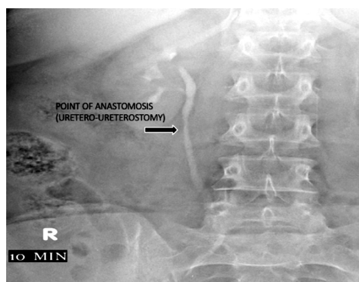
Figure 3 Postoperative intravenous pyelography film done after 6 months showing point of anastomosis and complete resolution of hydroureteronephrosis.