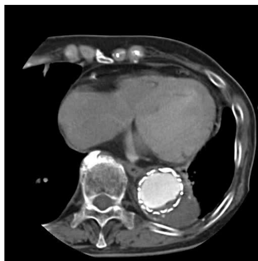
Video 2 CT angiography at the 10% R-R interval of the ECG gating from 0% to 100%.