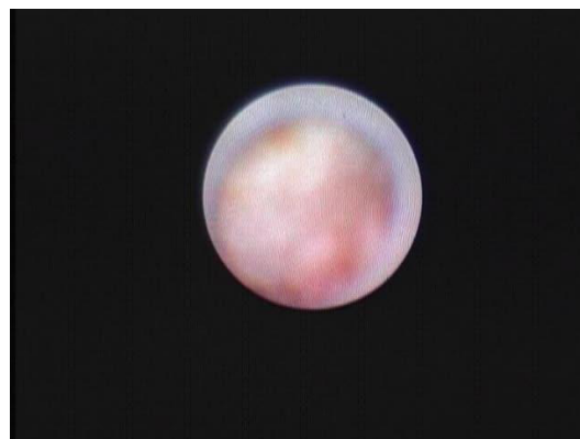
Video 1 Angioscopic movie showing suspicious blood flow over the graft.

A 72-year-old woman was admitted to our hospital complaining of chest pain at rest. She underwent thoracic endovascular repair (TER) using three stent grafts (GORE TAG 34×150, 34×200 and 26×200 mm; W. L. Gore & Associates, Flagstaff, Arizona, USA) with type B aortic dissection 5 years earlier (figure 1A). Coronary CT angiography (CTA) findings were inconclusive because of remarkable massive calcification in all coronary arteries. As a low-density area suspected of mural thrombus inside the second stent graft was detected (figure 1B), non-obstructive angiography was performed to evaluate graft failure besides invasive coronary angiography. 1 No significant stenosis was found using invasive coronary angiography; however, suspicious blood flow through the graft was observed at the aneurysmal descending aorta in the middle of the second graft (figure 2 and video 1). Being uninfluenced by aortic blood flow, it was thought to exist over the graft. At the site, neither the first nor the third grafts overlapped. The graft might have separated from the stent or leaked blood might have invaded the graft because the flow spread to the graft's posterior side. No mural thrombi or massive plaques were detected.