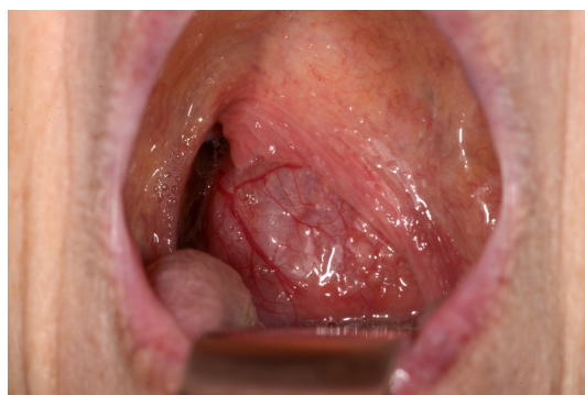
Figure 1 Clinical photograph of the oral cavity demonstrating a large left-sided posterior pharyngeal wall swelling, occluding most of the oropharynx.

A CBT is a paraganglioma arising at the carotid bifurcation and is derived from neuroectodermal tissue. These are highly vascular, generally slow-growing benign tumours that can remain asymptomatic and therefore undetected for years. Classically, patients with CBTs present with a non-tender, rubbery neck lump, with or without associated cranial nerve palsies due to local invasion or