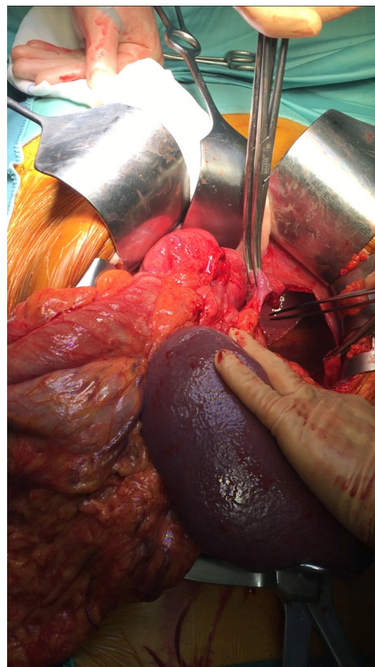
Figure 2 The wide gap through which the herniation occurred and some of the herniated viscera.