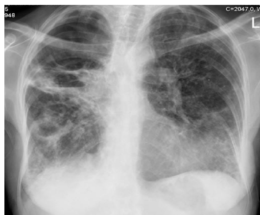
Figure 1 Chest X-ray. Two cavities in the right lung and a consolidation in the left lower lobe.

These striking images are the result of a rare infectious disease in an immunocompetent patient. Incomplete adherence to treatment has been identified as an extremely important factor in the control of mycobacterial infections as well as a major obstacle in the eradication of the disease. 2