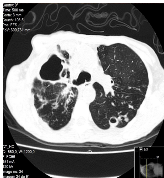
Figure 2 CT scan. Transversal plan—right upper lobe pneumatocele with multiple dispersed thick-walled lung cavitations.