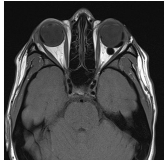
Figure 2 Axial T1 MRI scan through the orbits illustrates migrated heavy liquid in the left intraconal retrobulbar space.

Five years following the left vitrectomy, the patient presented complaining of a mobile mass beneath the lateral aspect of the right upper eyelid. The left eye was asymptomatic. Consistent with her visual acuity following the retinal detachment surgeries, her corrected visual acuity