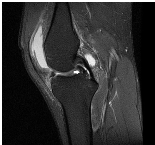
Figure 1 Sagittal MRI of the left knee. The torn medial meniscus can be observed as a second, smaller posterior cruciate ligament (PCL) just anteroinferior to the PCL.

The 'double PCL' sign refers to the anterosuperior displacement of a bucket-handle medial meniscal tear. 1 The torn fragment occupies an anteroinferior position relative to the PCL, producing an apparent second, smaller PCL (figure 1, figure 2). 2 The double PCL sign has been shown to have a high specificity for meniscal tears when noted on MRI. It is important to note, however, that there are normal variants of anatomy—in particular those of the ligaments of Humphrey and Wrisberg—which can give rise to a similar appearance. 3