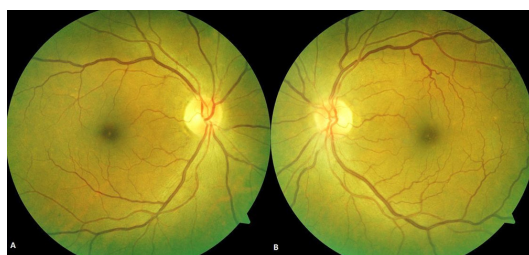
Figure 1 Fundus photograph of the (A) right and (B) left eyes showing a yellow dot at the foveal centre. There are other features of early hypertensive retinopathy and the left eye has minimal tortuosity of retinal vessels.