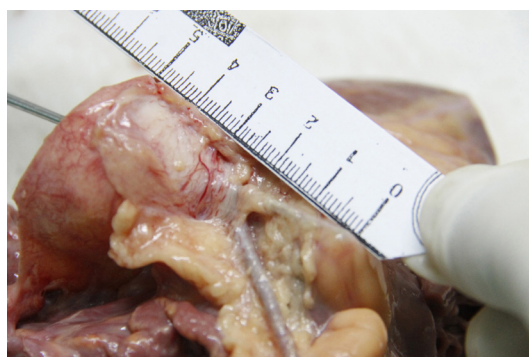
Figure 3 Intracardiac course of the doubling right coronary artery.