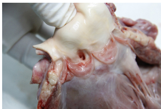
Figure 2 Identification of the duplication of the two coronary branches.