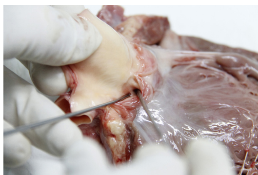
Figure 1 Doubling of the right coronary artery at autopsy.

We reported the case of a sudden death in a 14-year-old girl. At autopsy, the heart showed greyish areas and the histopathological surveys demonstrated the doubling of the right coronary artery (figures 1–4). The left ventricular myocardium showed a phlegmonous exudative inflammation, large necrotic areas and interstitial leucocyte infiltration, which resulted CD68 positive to the immunohistochemical investigations. The postmortem investigation of blood with haemoculture detected the presence of Staphylococcus aureus . The cause of death was: