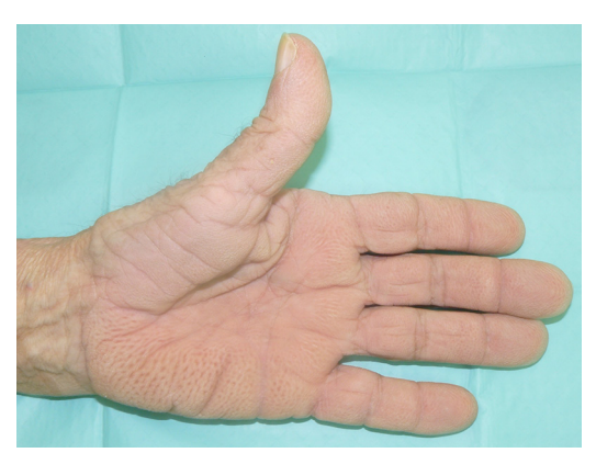
Figure 1 Thickened velvety palms with pronounced folds consistent with acquired pachydermatoglyphia.

Acquired pachydermatoglyphia (also known as tripe palms) is a proliferative paraneoplastic