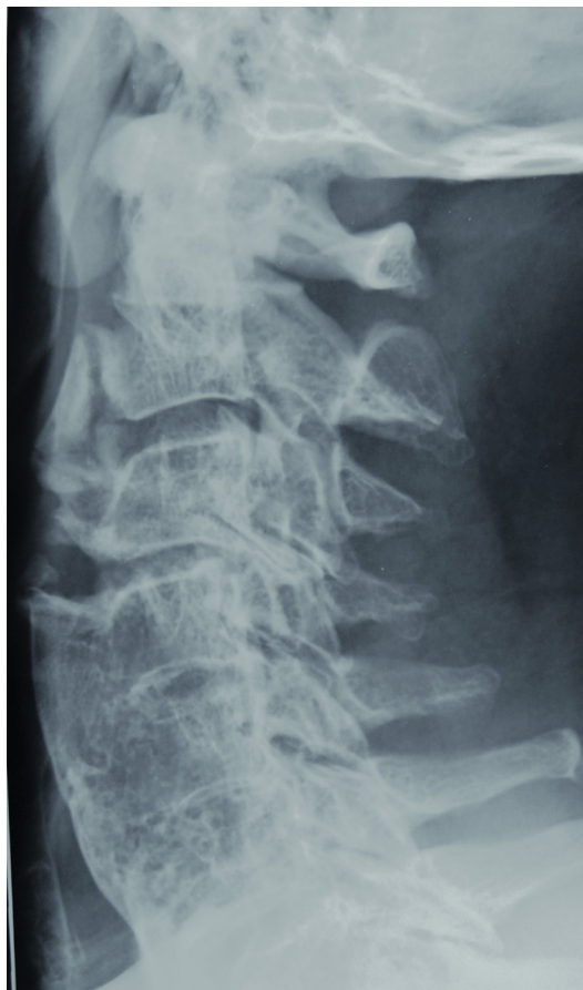
Figure 1 Cervical radiograph showing extensive osteophytosis in the anterior aspects of the lower cervical vertebrae.

In order to exclude an airway obstruction, a cervical radiograph was obtained. The exam showed anterior osteophytosis involving the lower segment of the cervical spine ( figure 1 ). A CT scan confirmed the diagnosis, revealing a tracheal narrowing due to anterior osteophytosis between C5 and C7 associated with thickening of adjacent soft tissues ( figure 2 ).