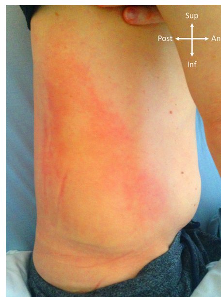
Figure 2 Erythematous discoloration and pitting oedema of the right flank (Grey-Turner's sign) manifesting 4 days after the onset of symptoms.